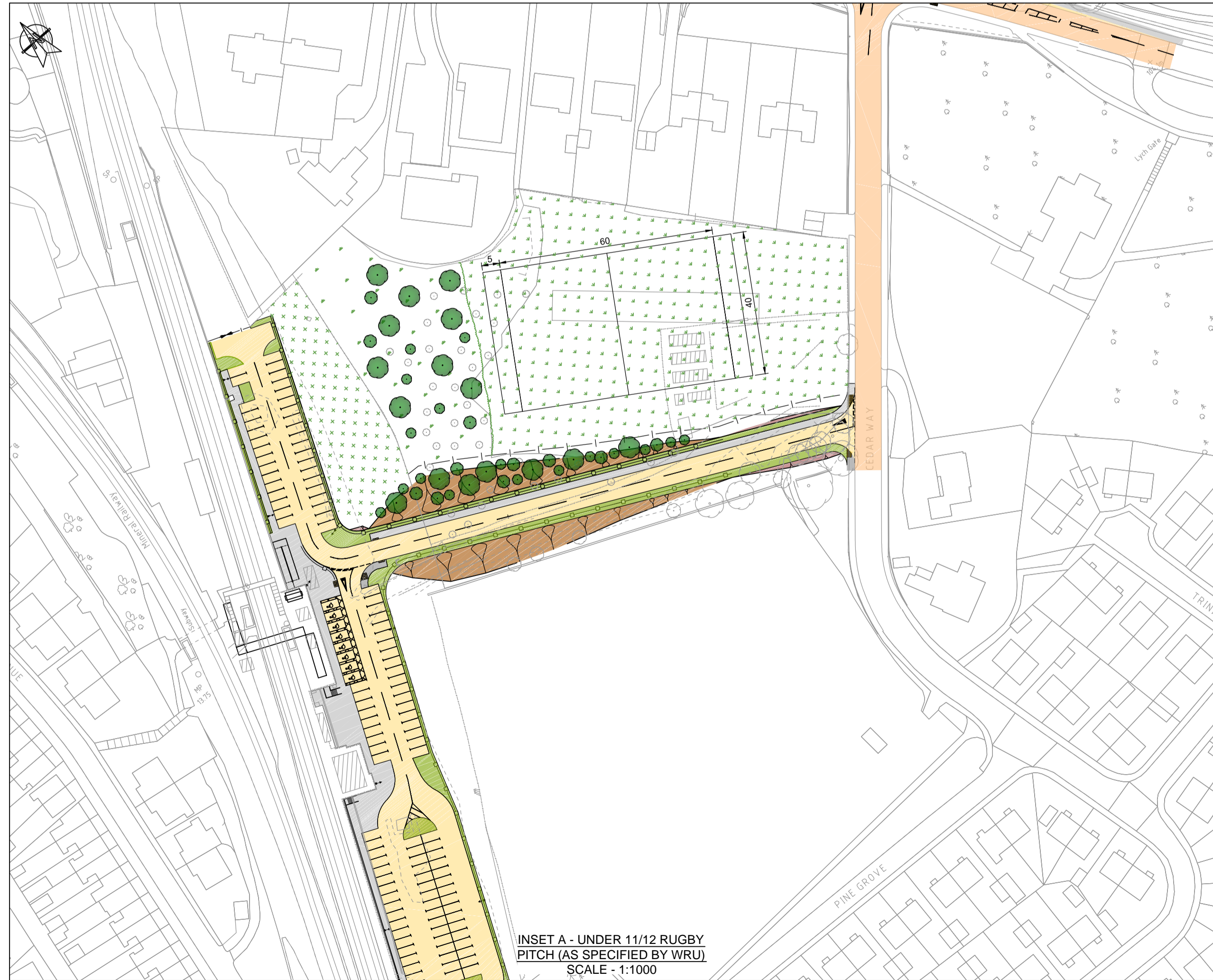
INSET A - UNDER 11/12 RUGBY PITCH (AS SPECIFIED BY WRU) SCALE - 1:1000